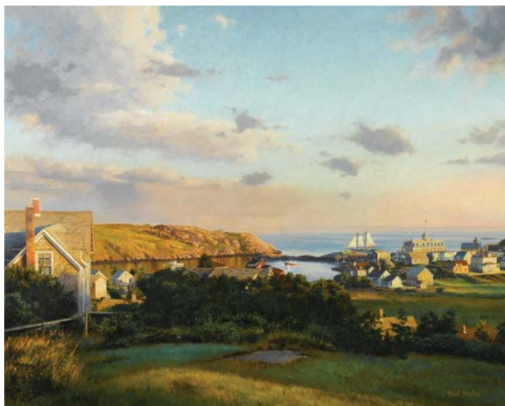
View of Monhegan Island (oil, 24x30)

A former illustrator with national clients in publishing and advertising, Hughes is a full-time painter who has done major commissions for the National Civil War Museum and other groups.